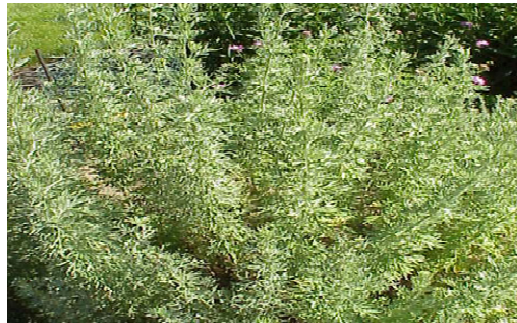
Artemisia Frigida (Fringed Sage)