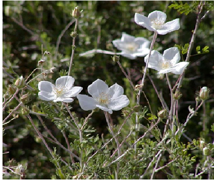
Falugia Paradoxa (Apache Plume)