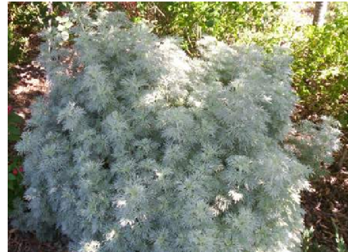
Artemisia 'Powis Castle'