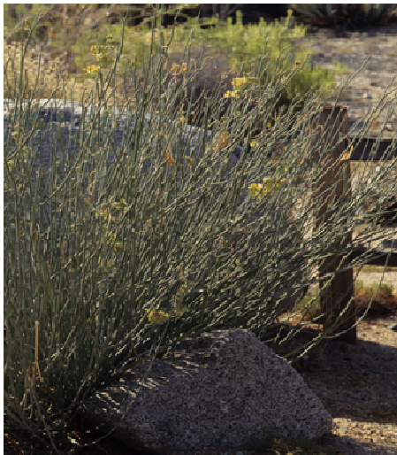
Asclepias Subulta (Desert Milkweed)