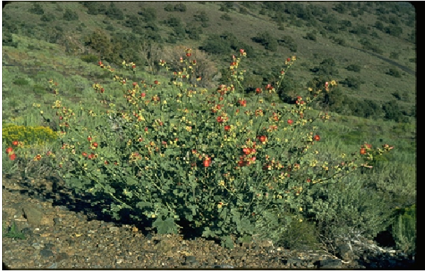
Sphaeralcea Ambigua (Desert Globemallow)